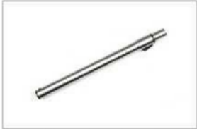
Metal telescopic tube